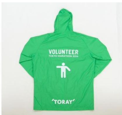
Foreign Language Volunteers