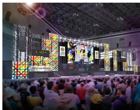
Digital image only